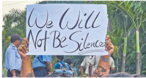
In rage, an agitator holds a poster during a protest over the death of a Nepali student on the Kalinga Institute of Industrial Technology (KIIT) campus, in Bhubaneswar, on February 19, 2021.

The latest available All India Survey on Higher Education (AISHE) data reveals that during 2021-22, 46,878 foreign students from 170 nations were enrolled in various institutes of higher learning in India