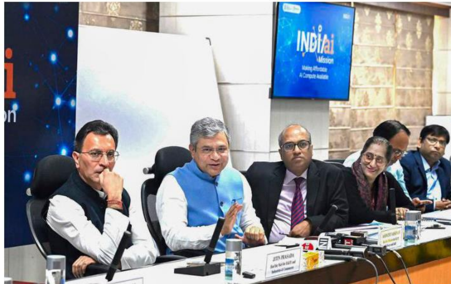
New realms: Union Minister Ashwini Vaishnaw along with others during announcement of various projects under IndiaAI Mission, in New Delhi.

The IndiaAI Datasets Platform is one of the seven pillars of the IndiaAI Mission, the Union government's main state-backed AI effort. The Mission has an outlay of ₹10,370 crore, and last month the Centre announced that under its Compute Capacity pillar, start-ups and academia would be able to use pooled access to graphics processing units (GPUs), which are needed to train and run AI models. Other than translation, the limited datasets include submissions from Telangana's own open data initiative, such as health data; 2011