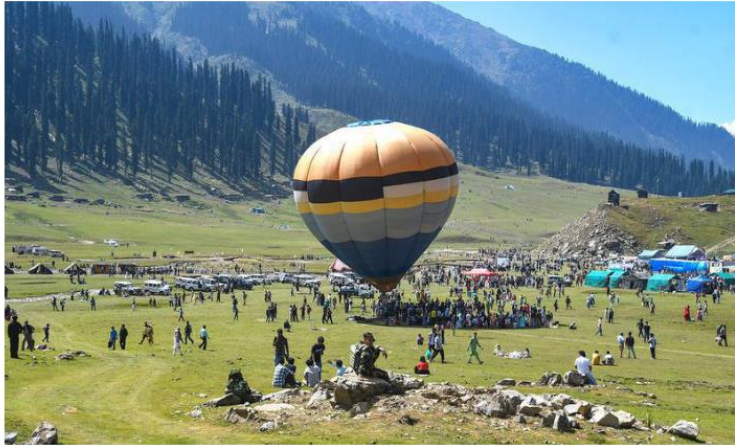
New destination: Tourists waiting for a hot air balloon ride at Bangus Valley in J&K.

"To maintain ecological balance, the department concerned has focused on avoiding construction of massive buildings and hotels. The aim would be to develop the area as an ecotourism destination," Chief Minister Omar Abdullah said, while speaking in the