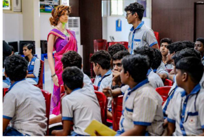
India's first AI teacher 'Iris' interacts with students at a school at Attingal in Thiruvananthapuram, Kerala.