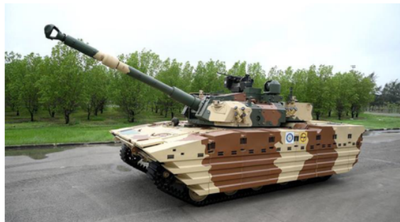
The Pune-based Electro Pneumatics & Hydraulics will handle the Indian segment of the deal. FILE PHOTO

It will be a 60:40 JV between JCD and EPH in