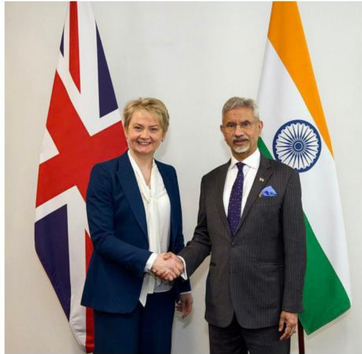
External Affairs Minister S. Jaishankar with Home Secretary Yvette Cooper in London on Tuesday.

cussed the flow of talent, people to people exchanges, and joint efforts in tackling trafficking and extremism", according to Mr. Jaishankar.