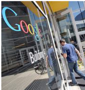
Google will now have to allow alternative payments system for apps.

allow alternative payment systems for apps and in-app purchases. It also confirmed Google cannot discriminate against other UPI-based payment systems for the transactions.