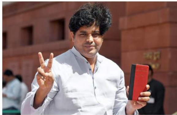
The Gujarat Police had filed a case against Imran Pratapgadhi, accusing the Congress MP of inciting discord through his poem.

Restrictions and rights Justice Bhuyan explained to Solicitor-General Tushar Mehta that the "reasonable restrictions" on free speech must remain reasonable. "Restrictions cannot be harmful or oppressive. Restrictions cannot overshadow the fundamental right to free speech," Justice Bhuyan said pointedly.