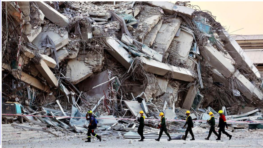
Shell-shocked: Rescue workers near an under-construction building that collapsed after the tremor hit Bangkok, Thailand, on Friday.