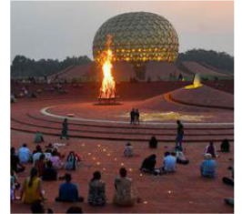
The members of Auroville Foundation gather around the Matrimandir. FILE PHOTO

Setting aside the NGT verdict of 2022, Justice Trivedi concluded that the Tribunal had "committed gross error in assuming the