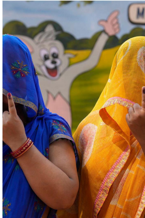
Women voters after casting their vote in the Lok Sabha elections in Prayagraj, on May 25, 2024.

Mere beneficiaries or active agents? As mentioned earlier, it was only in 2010 that there was a significant increase in the share of women who voted; and all political parties sought to capitalise on this shift by introducing policies and schemes specifically targeting women. However, these policies often frame women as passive beneficiaries rather than political agents. Welfare programs like Ujjwala and the Pradhan Mantri Awas Yojana were pivotal to the Bharatiya Janata Party's (BJP) victory in the 2019 Lok Sabha elections, while schemes like 'Ladli Behna' and 'Ladli Laxmi' were credited for the party's success in Madhya Pradesh. These initiatives reinforce the