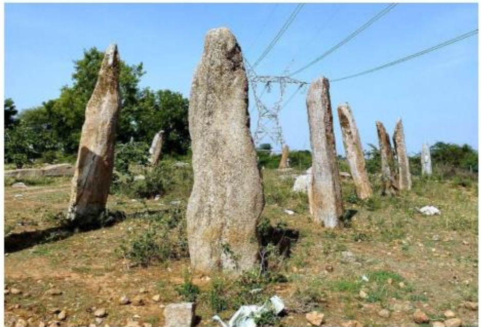
The menhirs in Mudumal in Narayanpet of Telangana.

“Nearly 1,200 large sized stones standing vertically map the skies as it existed 3,000 years ago. From them, we know the date and positions of the