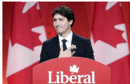
Outgoing PM: Justin Trudeau speaking during the Liberal leadership announcement in Ottawa, Ontario, on Sunday.