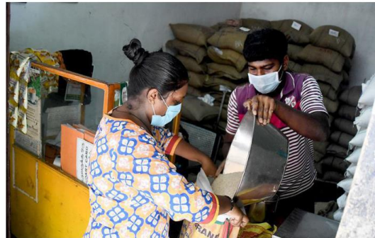
Hard hit: Women's share in the workforce fell due to their over-representation in certain sectors.

After countries borrowed money to protect welfare and livelihoods, global government debt has risen by 12 percentage points since 2020, with steeper increases seen in emerging markets. The pandemic sparked high levels of inflation, which proved to be a major concern in the 2024 U.S. elections. Fuelled by post-lockdown spending, government stimulus packages and shortages of labour and raw materials, inflation peaked in many countries in 2022.