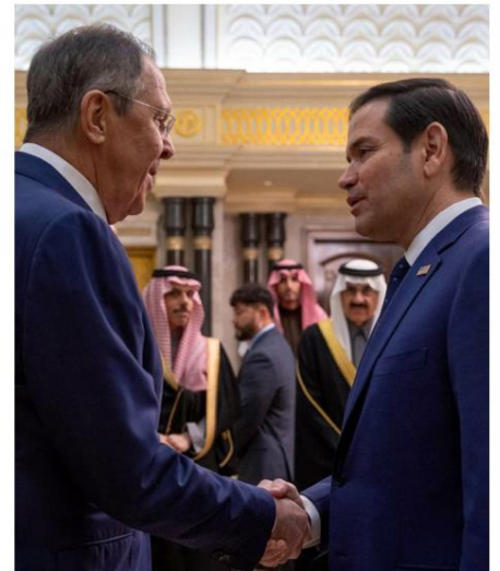
Peace bid: Russian Foreign Minister Sergei Lavrov with U.S. Secretary of State Marco Rubio in Riyadh on Tuesday.

"Should this conflict come to an acceptable end, the incredible opportunities that exist to part-