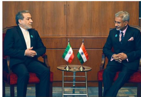
Way forward: External Affairs Minister S Jaishankar with Iranian Foreign Minister Abbas Araghchi in Muscat on Sunday.