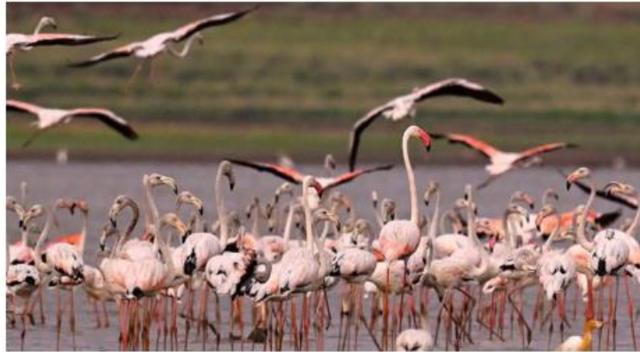
Winged visitors: A similar flamingo festival was conducted at Sullurpeta in 2020.