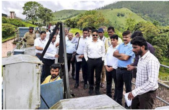
Safety check: Supreme Court-appointed monitoring committee members inspect Mullaperiyar dam in Kerala, on June 13, 2024.

A three-judge Bench headed by Justice Surya Kant said the Dam Safety Act, 2021, was "existing on paper" after the State of Kerala argued that "nothing has been done", including the constitution of a National Committee on Dam Safety. "Despite Par-