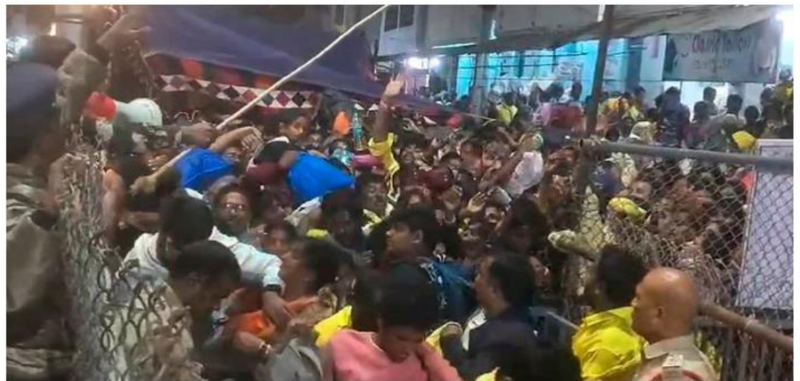
Rush for darshan: People gathered near a ticket counter at Vishnu Nivasam, Tirupati on Wednesday.

whelming crowd at the counters, including Vishnu Nivasam, Bairagipatteda, and Ramachandra Pushkarini, led to chaos as the arrangements were reportedly not adequate. The police had a tough time controlling the crowd.