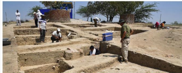
Buried secrets: Different structures are exposed in a trench at Rakhigarhi, a Harappan site in Haryana, in 2022.

loanwords in the Rigveda; the substratum influence of Dravidian on the Prakrit dialects; and computer analysis of the Indus texts revealing that the language had only suffixes (like Dravidian), and no prefixes (as in Indo-Aryan) or infixes (as in Munda)," Mahadevan wrote. As the Dravidian models of decipherment had still little in common except certain basic features, "it is obvious that much more work remains to be done before a generally acceptable solution emerges," according to him.