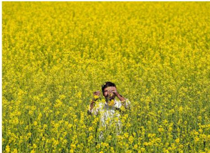
Two judges had ruled differently on whether the Centre was right in according approval to genetically modified mustard.

An expert member with any direct or indirect association with a matter being discussed in a meeting of the committee is obliged to disclose this prior to the meeting. Unless specifically requested by the com-