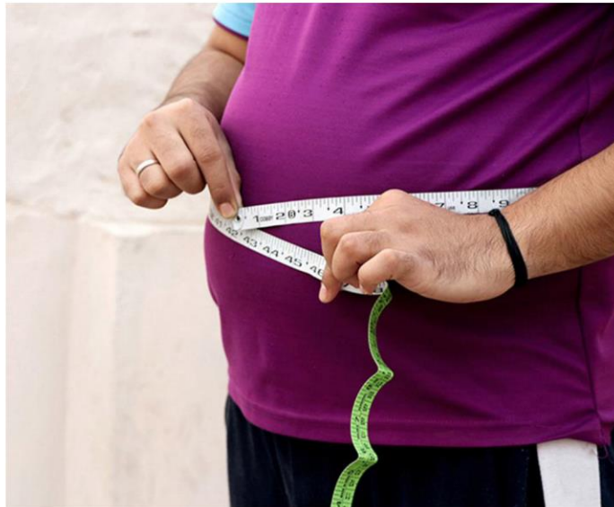
One in eight in the world is obese, and one in three is overweight, according to the WHO.

Childhood obesity is a serious health hazard increasingly growing in India. Childhood obesity can lead to poor self-esteem and depression. Children who