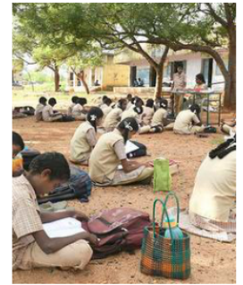
67,000 schools operate without functional toilets, of which a majority are government-run.

Of the 10.17 lakh government schools, functional drinking water facility is available in 9.78 lakh schools. Of the 4.46 lakh