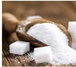
The export ban came into effect in October 2023 to regulate domestic prices.

The move is expected to boost liquidity for sugar mills and balance sugar availability and prices for farmers. The Food Ministry's order allows the mill-