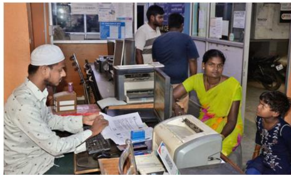
Inclusive approach: People waiting for caste certificates in Sangareddy district, Telangana. FILE PHOTO

Among the fresh additions, 46 communities have been recommended for OBC status, 29 for SC status, and 10 for ST status. The greatest number of fresh additions were re-