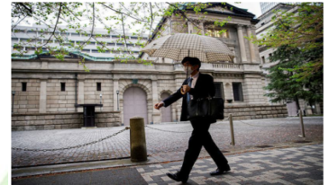
Costly step: This would lift short-term borrowing costs to levels unseen since 2008 global financial crisis.