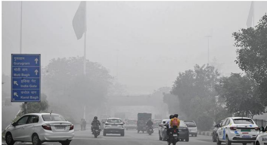
Bad air: Smog envelops Delhi on Monday as air quality remained in the 'severe' category. Schools have since been ordered to switch to online classes.

Though the Delhi government said it had stopped construction work in the capital, lawyers alerted the Bench to build-