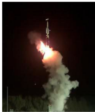
High aims: Flight trial of the hypersonic missile being done off the coast of Odisha.

"The missile is designed to carry various payloads for ranges greater than 1,500 km for all the services of Indian armed forces," the DRDO said in a statement. "The missile was tracked by various range systems, deployed in multiple domains. The flight data obtained from down-