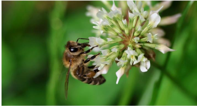
Bee in the bonnet: A western honey bee rests on a clover flower in Frankfurt, Germany.

"We cannot exclude the possibility of spillover if wild species are forced to share spaces due to loss of habitat or if managed