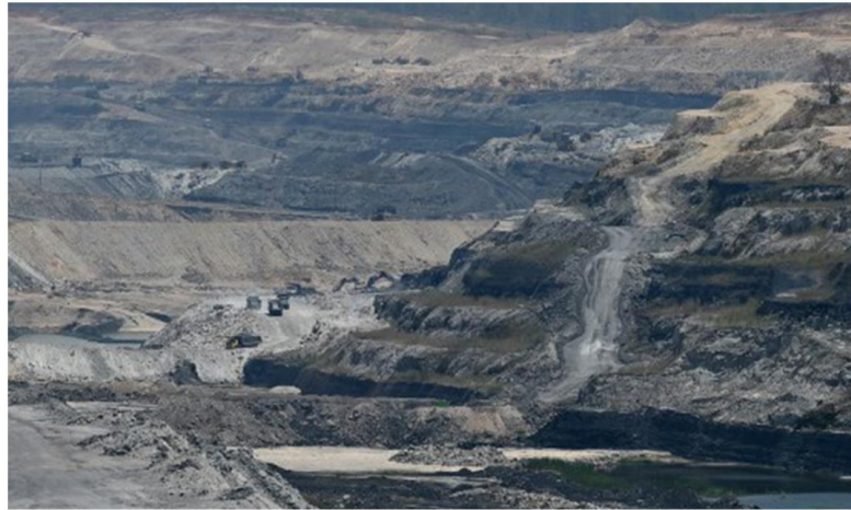
Major hurdle: This April 1 photograph shows a general view of the Parsa East Kente Basan coal mine in Surguja district, Chhattisgarh.

So overall, neither climate change nor climate action is currently equitable.