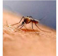
Telangana reported 178 cases of chikungunya till August, surpassing last year numbers.

"If you are pregnant, reconsider travel to the state of Telangana, India, particularly if you are close to delivering your baby. Mothers infected around the time of delivery can pass the virus to their baby before or during delivery. Newborns infected in this way or by a mosquito bite