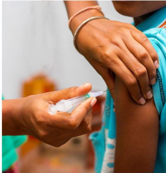
Insulin is not a cure but a treatment, allowing people with diabetes to live near-normal lives.

Climax at the University of Toronto After serving as an orthopaedic surgeon in the First World War, Frederick Banting returned to Canada as a war veteran. Driven to pursue research, he approached John Macleod, head of the physiology department at the University of Toronto, in 1920, with the idea of identifying the pancreatic secretion responsible for carbohydrate metabolism. Macleod, though hesitant, provided laboratory space and assigned Charles Best, a medical student, to assist him. Together, Banting and Best conducted experiments on dogs, leading to the successful isolation of insulin from the islets of Langerhans.