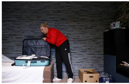
Desperate move: The Portuguese government is offering tax exemptions as high as 100%.

He is doubtful the government's new measures will be enough.