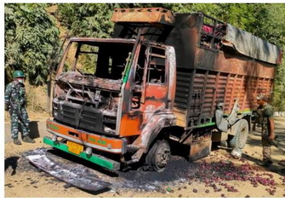
Tension rises: A truck damaged after armed militants set it on fire in Jiribam district on Thursday.

A senior government official explained that the Army and the Assam Rifles would be able to conduct operations without waiting for the arrival of a Magistrate and the State police.