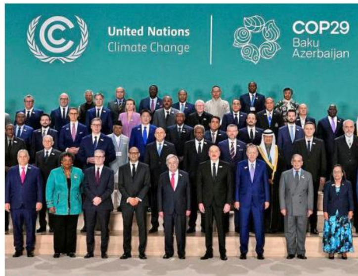
Planetary mission: Delegates at the COP29 Climate Summit in Baku, Azerbaijan on Tuesday.

rounds of talks involving the parties (country signatories to the Paris Agreement) on these outstanding concerns that are raised. Last month, a UN supervisory body, which will be the ultimate arbitrator of the market, set out a draft text that laid out the standards for carbon removal and assessing projects.