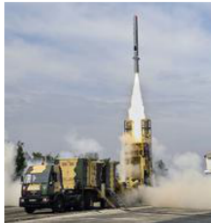
The Long Range Land Attack Cruise Missile being launched off Odisha.

The missile has been developed by the Aeronauti-