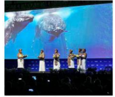
Colombian women perform during the opening ceremony of COP16, a United Nations' biodiversity conference, in Cali, Colombia, on Sunday.