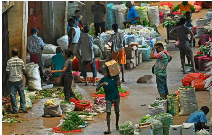
Debt trap: In 2022, countries paid more to service external debts than they received in new finance.

The U.S. Treasury's top economic diplomat has called for new ways to provide short-term liquidity support to low- and mid-