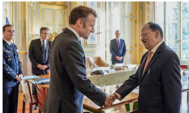
National Security Adviser Ajit Doval with French President Emmanuel Macron in Paris on Tuesday.

the commitment to implement the Horizon 2047," the Indian Embassy in France said in a post, adding that Mr. Macron had "stressed the value of India and France's efforts to advance peace and address global challenges; appreciated Mr. Modi's initiatives". While the reference to the peace initiatives is mainly in relation to the