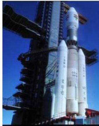
LVM-3 is the chosen launch vehicle for the mission: ISRO

The agency said that after the cruise phase, Venus Orbit Injection (VOI) will be at 500 km x 60,000 km. "Aerobraking will be em-