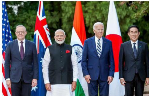
(From left) Anthony Albanese, Narendra Modi, Joe Biden, and Fumio Kishida at the 'Cancer Moonshot' event in Delaware.

A Maritime Initiative for Training in the Indo-Pacific (MAITRI) to train Quad